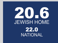
AVERAGE LENGTH OF STAY (# of DAYS)