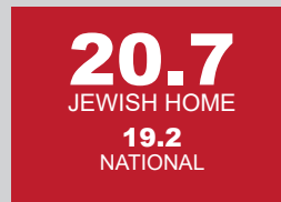
CHANGE IN FIM SCORES The higher the number, the better.

This is the gold standard used for measuring outcomes in post-acute care.