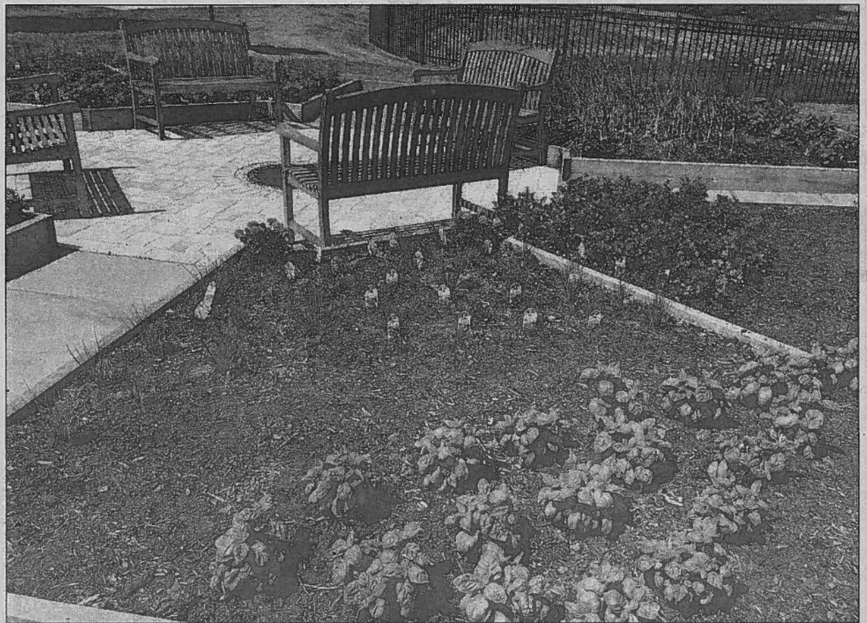
Herb garden planted in honor of Herb Ouzer at the Summit at Brighton.