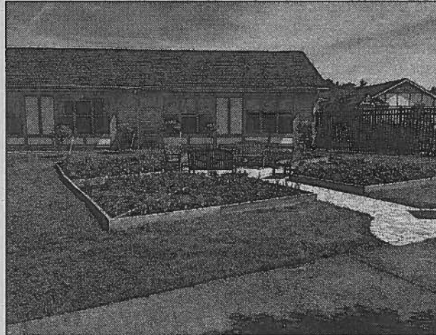
The herb garden at the Summit at Brighton.