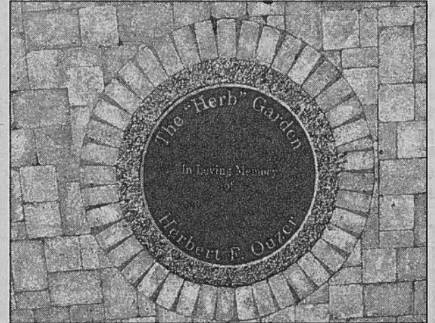
Herb Garden Plaque.